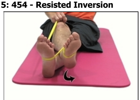
Sets: 2 Reps: 10 Sessions: 2 Everyday Resistance: as tolerated

• Place band around foot Move toes and foot inward